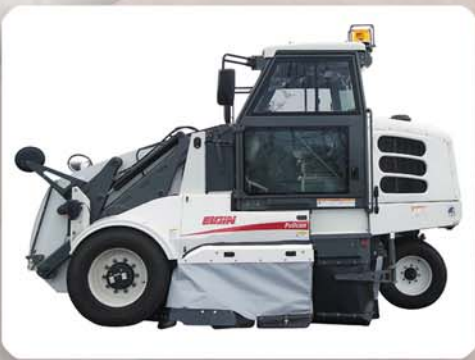
PW Model – Hydraulic Waterless