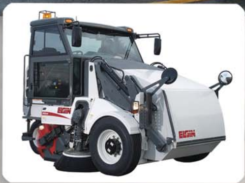
S Model – Mechanical