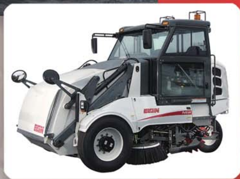
P Model – Hydraulic