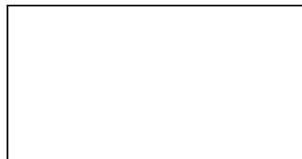
Photo illustrations in this brochure include optional components. Specifications subject to change without notice. Elgin® and Whirlwind® are registered trademarks of Elgin Sweeper Company. Effective 7/06. Printed in U.S.A. ©2006 Federal Signal Corporation. Federal Signal Corporation is listed on the NTSE by the symbol FSS.